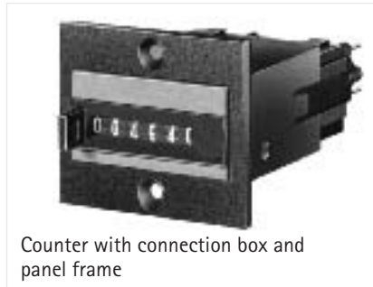
Counter with connection box and panel frame